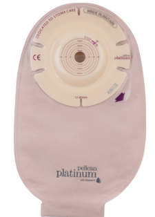
Vitamin E Convex Drainable