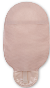
Vitamin E Convex Urostomy Bung