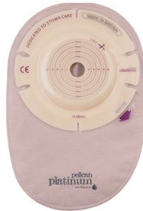
Vitamin E Convex Closed