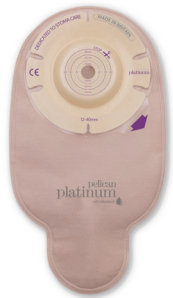
Vitamin E Convex Urostomy