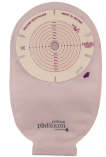
Vitamin E Drainable