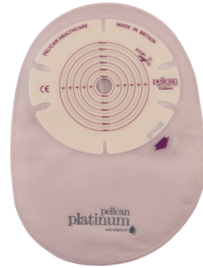
Vitamin E Closed