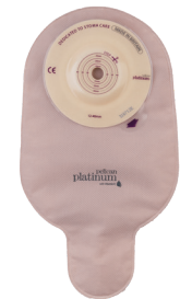
Vitamin E Convex High Output