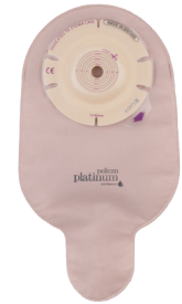
Vitamin E Contour Convex High Output